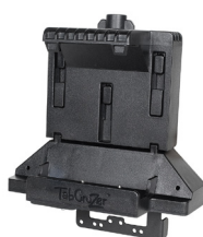
Gamber Johnson Vehicle Dock