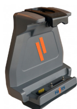
Havis Vehicle Docks