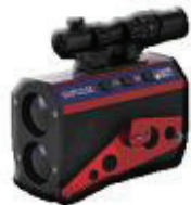
Impulse/ Forest PRO (LTI)