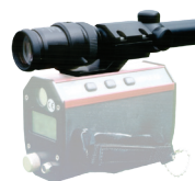
LTI Impulse/ Forest PRO (LTI)