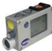
Vertex IV (Haglof)