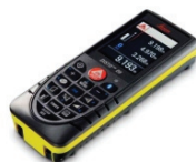
Disto 8 (Leica)